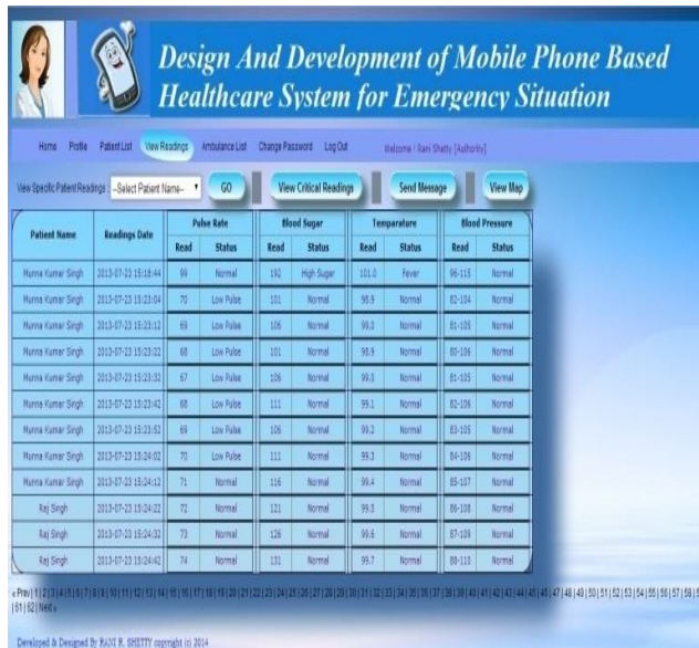
Fig. 4 Screen Shot of Patients readings

Lastly, I extend my heartfelt thanks to my parents, family and friends for their in time kind support.