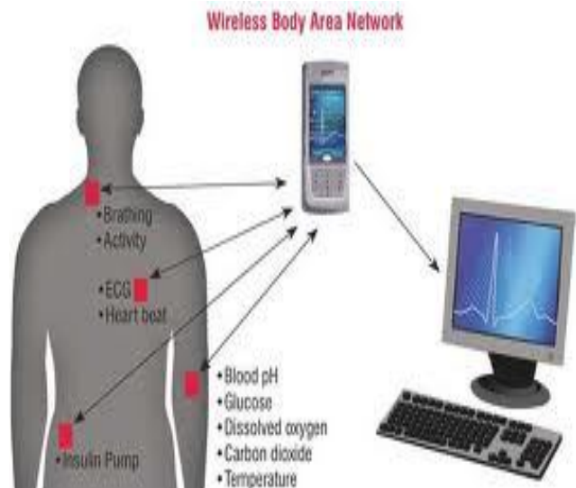
Fig. 1 Mobile Healthcare system

Mobile Healthcare system framework aims at design and development of portable primarily based Healthcare system. We also provide the security and privacy issues, and develop a user-centric privacy access control of opportunistic computing in Mobile Healthcare emergency situation. This project mainly consists of 2 modules i.e. one module will be integrated in patient android mobile, which is associated with many sensors like heartbeat measurement and sugar level management. This module frequently activates sensors via android mobile and measures various parameters of individual patient such as blood sugar level, body temperature, heartbeat, blood pressure and sends these details to hospital server, where the second module gets installed. This module receives data and suggests patients accordingly over text or voice call via mobile. And in case of emergency it activates ambulance call to its nearest hospital. Thus, using android platform we increase the hospital service level being provided to patients. The below fig. 1 shows the mobile healthcare system.