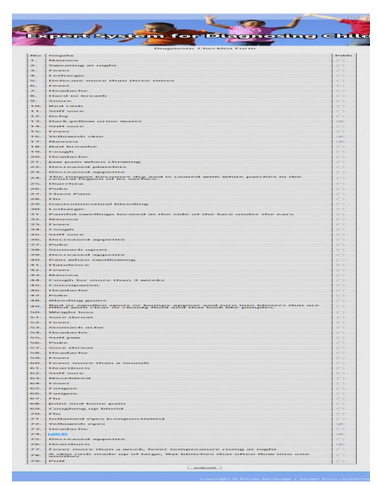
Figure 3selected symptoms on diagnostic form page

Certainty factor Calculation testing results is done by calculating manually selected symptoms checklist form diagnostic page. The symptoms that were check listed on this page are yellow is he yes, yellowish skin, dark yellow urine water, nausea, and heart burn puke, as shown infigure3.