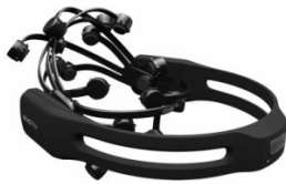
Fig 1:Emotive EPOC+ device

Emotive EPOC+ device is a signal measuring device with 14 signal collection points and 2 reference points placed on the head and placed on the skull, which can transmit data wirelessly to the computer. Figure 1 shows an Emotive EPOC+ device image.