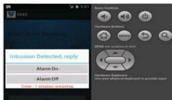
Fig 8: Pop up on receiving an intrusion SMS from the saved number.

GSM modem to transmit a warning SMS into already registered number in the modem. The SMS on the users' end is interpreted by the ANDROID Application and if it finds that the SMS is from the designated number; the application immediately informs the person with a frequent pop-up menu. If the user positive acknowledge the pop-up in 1 minute, an acknowledgement is send back to the remote GSM modem. The modem will output an interrupt to the microcontroller and the microcontroller will subsequently trigger an alarm. If the user fails to acknowledge in the defined time interval, an automatic positive acknowledgement will be sent by the application to the modem and the activities follow.