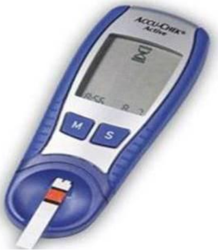
Fig 2: Accu-Chek

The height and weight of the person is asked. There is fields in which a person can enter and by clicking on calculate the software will be able to calculate. A format of BMI calculator is in Figure 3. Our body mass index (BMI) is an estimate of our body fat that is based on your height and weight. Doctors use BMI, along with other health indicators, to assess an adult's current health status and potential health risks. We can determine our BMI with the calculator shown below in figure 3.