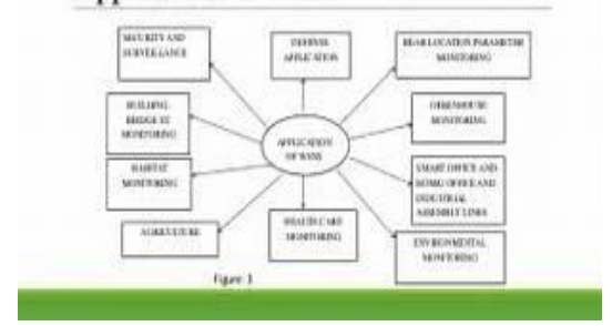
Fig . 1