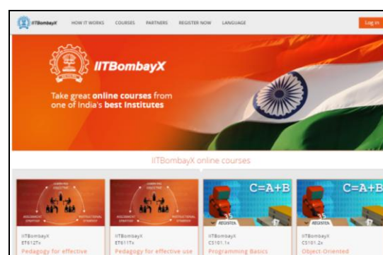
Fig. 3. Home Page of IIT BombayX.

IITBombayX is a non-profit MOOC platform developed by IIT Bombay using the open-source platform Open edX, in 2014. It was created with funding from National Mission on Education through Information and Communication Technology (NME-ICT), Ministry of Human Resource Development (MHRD), Government of India. Currently, it is offering 63 courses on different subjects from multiple disciplines. Some of the courses provided are as shown in Fig. 3.