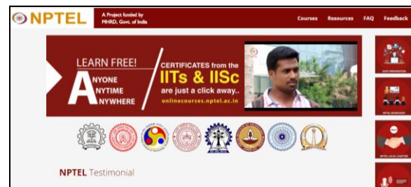
Fig.1 Home Page of NPTEL online courses.

NPTEL stands for National Programme on Technology Enhanced Learning. It is a project funded by MHRD, initiated in 2003. It is a joint initiative of seven Indian Institute of Technology (IITs) and Indian Institute of Science (IISc) for offering courses on engineering and science, initially. Now, NPTEL has started online course in computer science; electrical, mechanical, and ocean engineering; management; humanities, music etc. It offers free course with nominal fees for certification. Anybody from anywhere can join their course. NPTEL portal offering courses is shown in fig. 1.