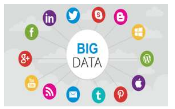
Figure 1 : Social Sites or Media using Big Data

variability, veracity, and value. In present time, every internet user have an account on at least one social media to connect with its known persons, society, or groups. Estimated 300 million ne photos / day unloaded on facebook; 300 million Instagram users share 60 million photos/ day, and more than 100 hrs / min video unloaded to YouTube.