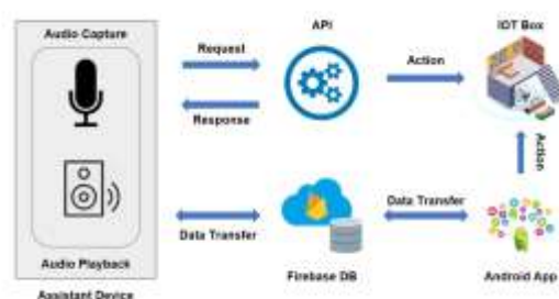
Fig 1. Basic architecture of Voice Controlled Personal Assistant

devices through WiFi and make them communicated with each other in future. This device can be very handy for day to day use and it can help you function better by constantly giving you reminders and updates. Why would we need it? Because your own voice is turning into a best input device than a conventional enter key. The architecture of basic Voice Controlled Personal Assistant Device is shown in fig 1.