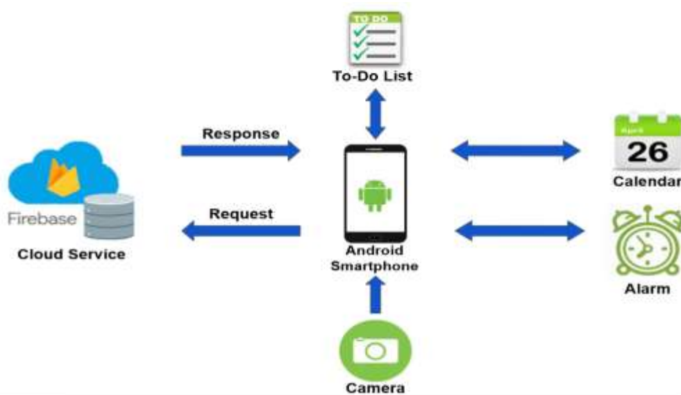
Fig 4. Firestore cloud system architecture

Android application helps the user to share his personalized data through android application with ease from anywhere. The data transfer and processing is done through network adapter inbuilt APIs. This data generated is stored in firestore cloud storage[5] and is available for the main system to access. All these tasks are being done in parallel to each other. All the data stored in Firestore cloud server is accessible to main system and can be retrieved and process as per required. The need of given data is also processed in parallel to continuous fetching of data from the server. Firestore cloud server architecture is shown in figure 4.