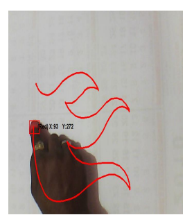
Figure: Finger Painting