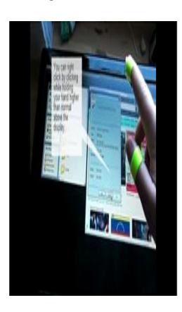
Figure: Free Air Finger Tracking