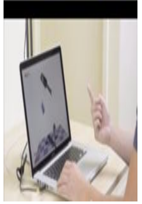
Figure: Virtual Reality based Game