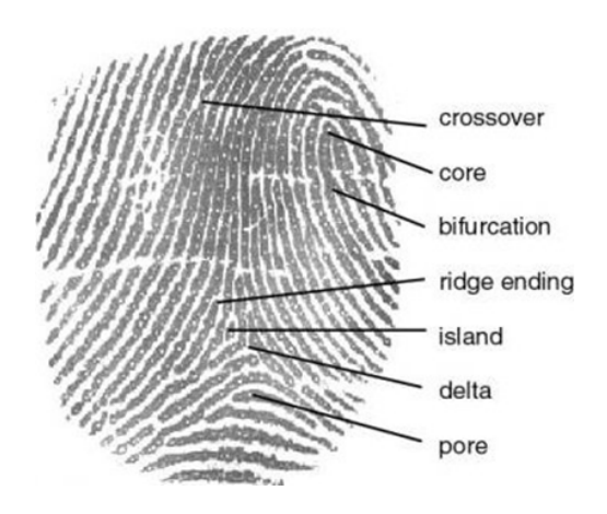
Fig.1 Minutiae Features In Fingerprint

Fingerprint recognition is one of the reliable, most important and useful biometric technique used for person identification and verification. Fingerprints are one of the maximum used biometric technologies for considered legal proofs of evidence in all over the world [1]. A fingerprint is an impression of the friction ridges found on the inner surface of a finger. A fingerprint is comprised of ridges and valleys, the ridges are the dark area of the fingerprint and valleys are the white area that exists between the ridges.