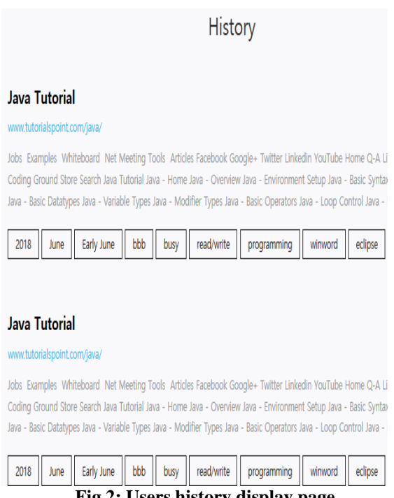
Fig 2: Users history display page

The enhancement of user experience is one of the key concerns while we consider for innovative features for web browsers. This motivation drives to consider the user behaviour with respect to usage of activities, location and time during the surfing of web. With these factors we can re consider the revisition concept to next higher level of enhancing and making rich user experience.