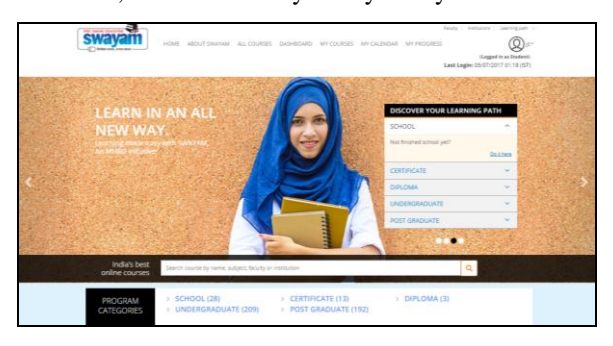
Fig. 4 Home Page of SWAYAM portal

Currently, SWAYAM offers the courses for school, certificate, diploma, undergraduate, and post graduate. Fig. 4 is showing the home page of SWAYAM portal. The responsibility of delivering courses is assigned to six institutes based on their type, such as NCERT and NIOS for offering school education, IGNOU for out of school learners, CEC for under-graduate education, UGC for postgraduation education, NPTEL for engineering, and IIMB for management studies. Though much of the course content for SWAYAM is the same content that has already been created for NPTEL, which is to be re-purposed for SWAYAM. Also, the content or videos created for this platform will be available on a platform called e-Acharya that already hosts educational video content created by MHRD. So, SWAYAM is promoting the best use of the resources, which is already a very costly affair.