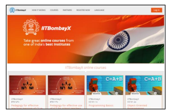
Fig. 3. Home Page of IIT BombayX.

IITBombayX is a non-profit MOOC platform developed by IIT Bombay using the open-source platform Open edX, in 2014. It was created with funding from National Mission on Education through Information and Communication Technology (NME-ICT), Ministry of Human Resource Development (MHRD), Government of India. Currently, it is offering 63 courses on different subjects from multiple disciplines. Some of the courses provided are as shown in Fig. 3.